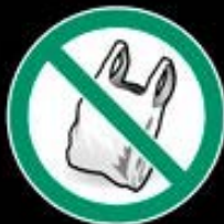
PLASTIC BAGS BOLSAS DE PLÁSTICO