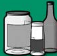
GLASS BOTTLES AND JARS BOTELLAS Y FRASCOS DE VIDRIO