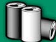
ALUMINUM CANS, FOIL & PIE TINS LATAS, PAPEL, Y MOLDES DE ALUMINIO