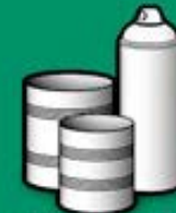
STEEL CANS AND EMPTY AEROSOL CANS LATAS Y AEROSOL VACIOS