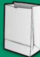
BROWN PAPER BAGS BOLSAS DE PAPEL