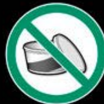
PLASTIC TUBS ENVASES DE PLÁSTICO