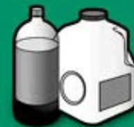
PLASTIC BOTTLES BOTELLAS DE PLÁSTICO