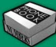
PHONE BOOKS GULAS DE TELÉFONOS