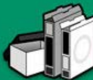
PAPERBOARD ENVASES DE CARTÓN